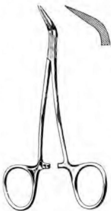
PEET 12.691.11 11.5 cm/4½"