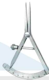
CASTROVIEJO-EPKER 135.40 9 cm/3½"