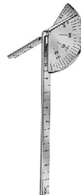
CAROLL 144.00 14 cm/5½"