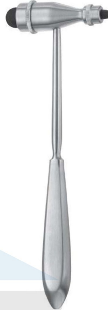
TROEMNER 034.24 22 cm/8¾"