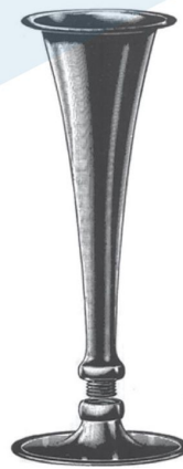
PINARD 248.15 15 cm/6"