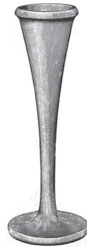
PINARD 250.18 18 cm/7"