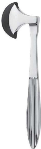
BERLINER 040.20 20 cm/8"