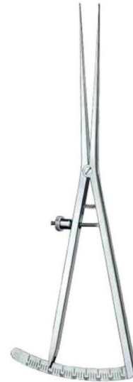
CASTROVIEJO-EPKER 136.40 18 cm/7"