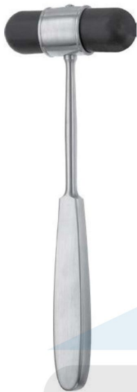
DEJERINE 016.20 20 cm/8"