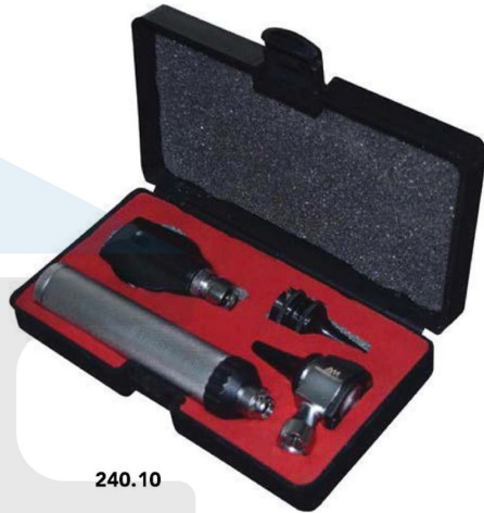
Ophthalmoscope & Otoscope Set