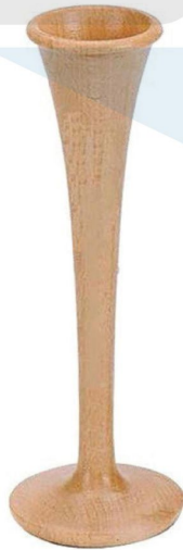
PINARD 242.18 18 cm/7"